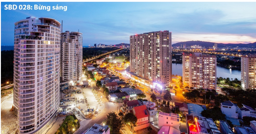
SBD 028: Bùng sáng

ORGANIZED THE 20 TH DIC GROUP SPORTS EVENT